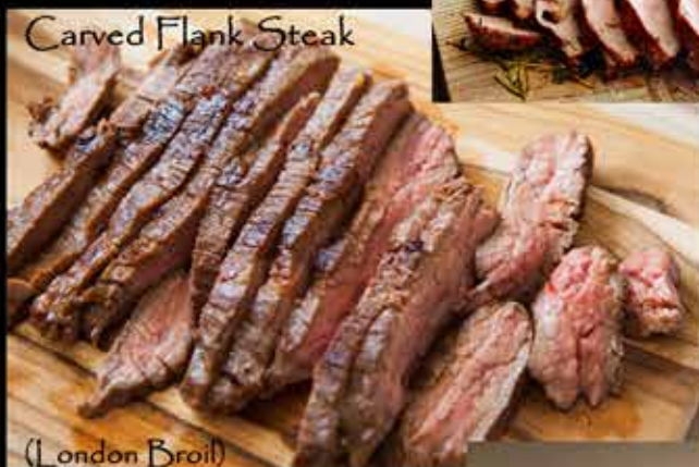
Carved Flank Steak

"Taste Is Remembered Guests Talk Food Speaks For Itself"