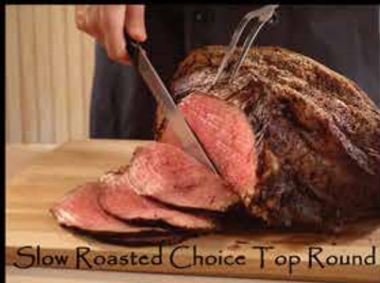
Slow Roasted Choice Top Round