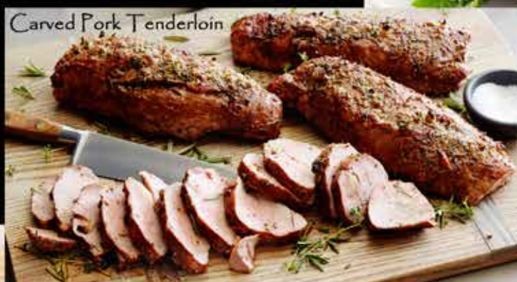
Carved Pork Tenderloin

"Taste Is Remembered Guests Talk Food Speaks For Itself"